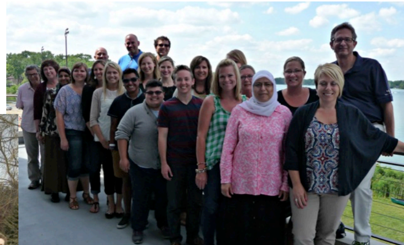
2014 – 2015 Teams