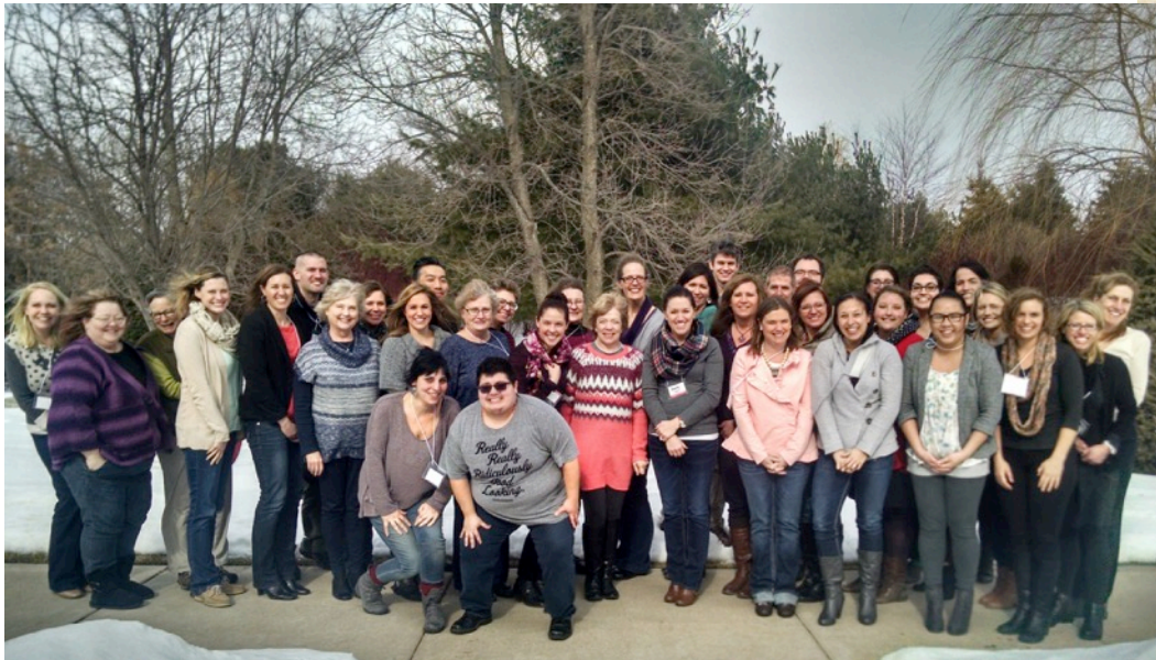
2015 – 2016 Teams

Continuing education and training for teams who want to build collaborative leadership and public health skills as they mobilize to improve the health of their communities